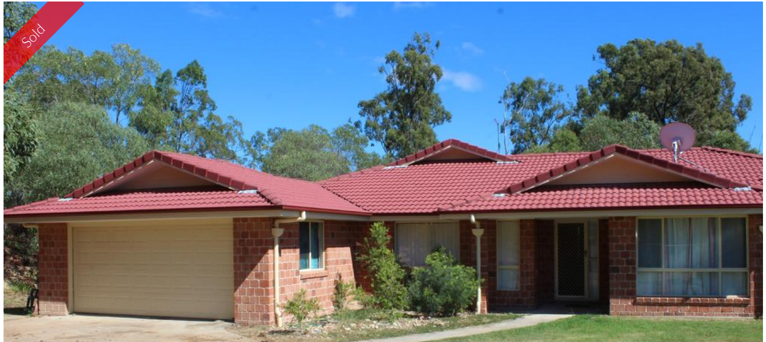
25 Bentley Dr, Regency Downs