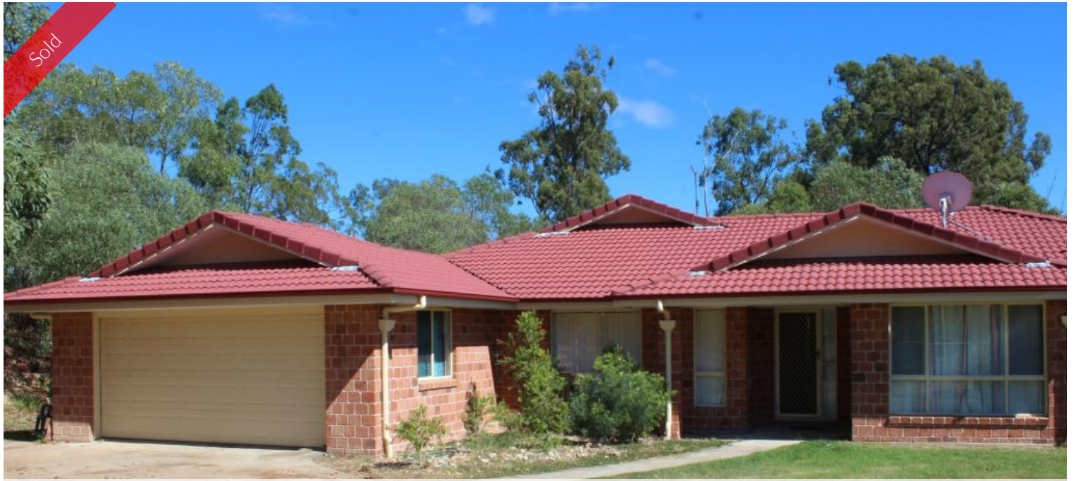
25 Bentley Dr, Regency Downs