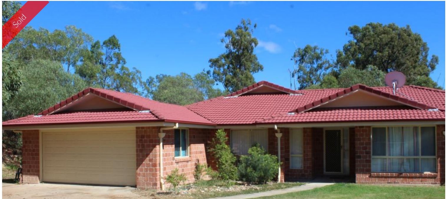
25 Bentley Dr, Regency Downs