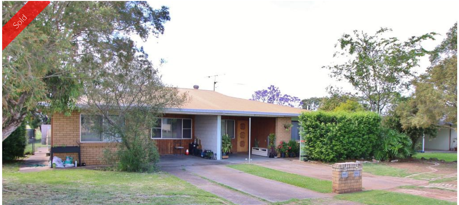
A & B, 36 Buaraba Street, Gatton