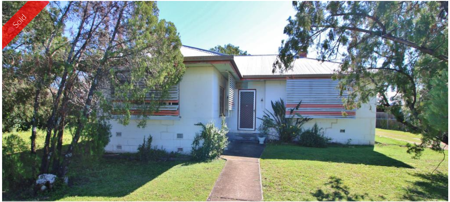
6 Railway St, Laidley