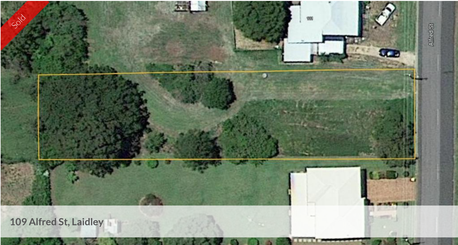
109 Alfred St, Laidley