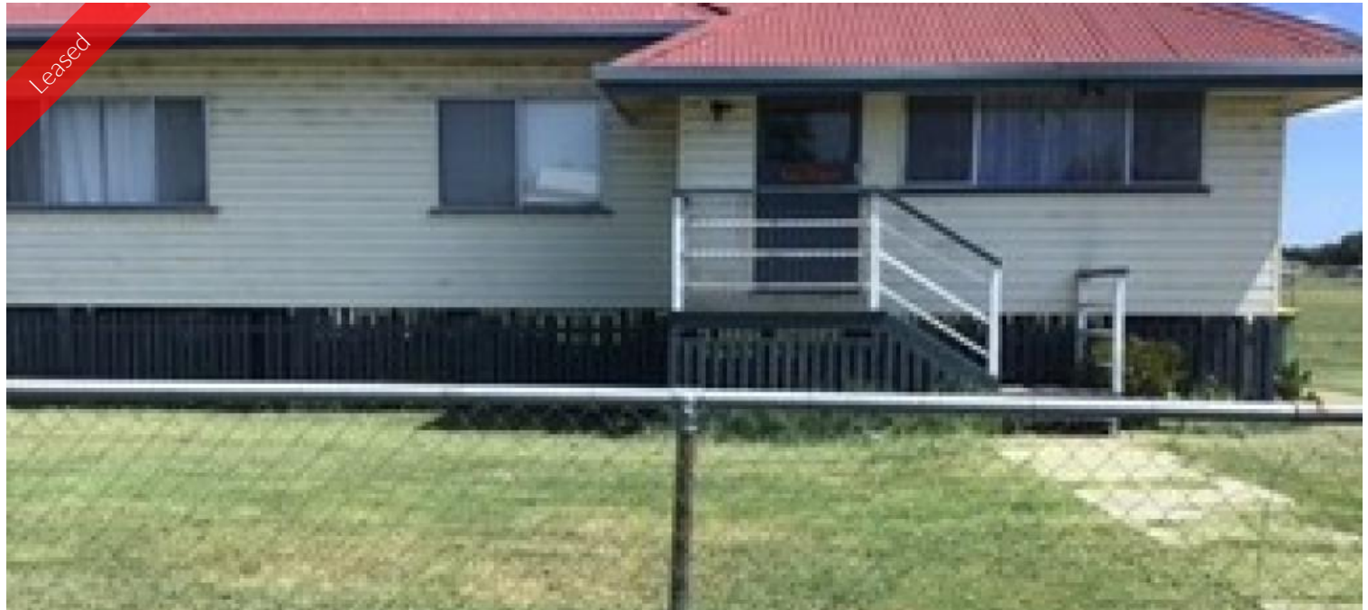
Lot 342 Cnr Hayes & Cooper Street, Laidley