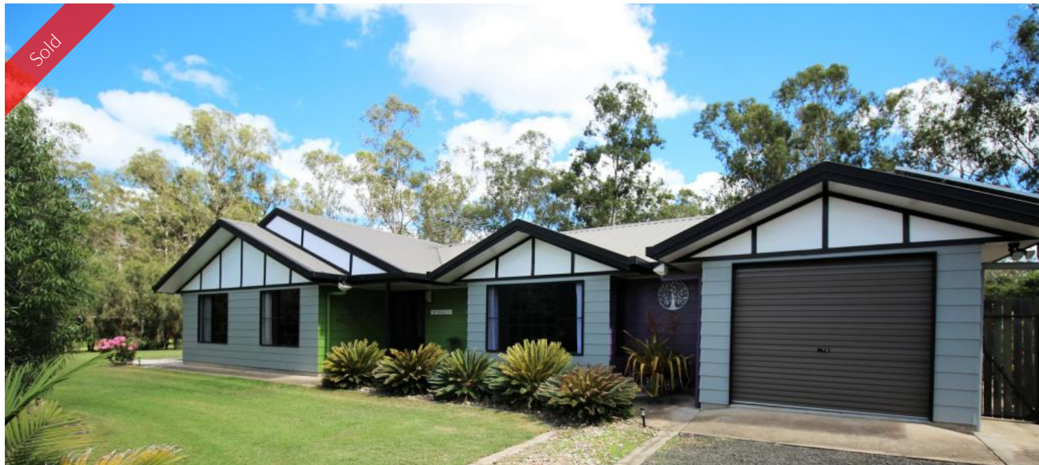
14 Lewis Ct, Lockyer Waters