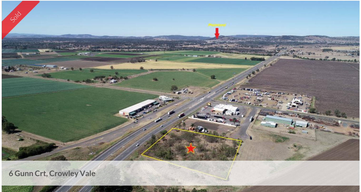
6 Gunn Crt, Crowley Vale