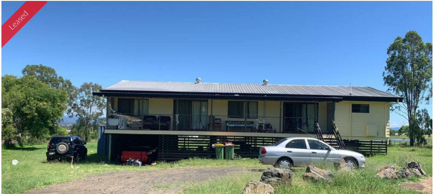
19 Stieler Dr, Plainland