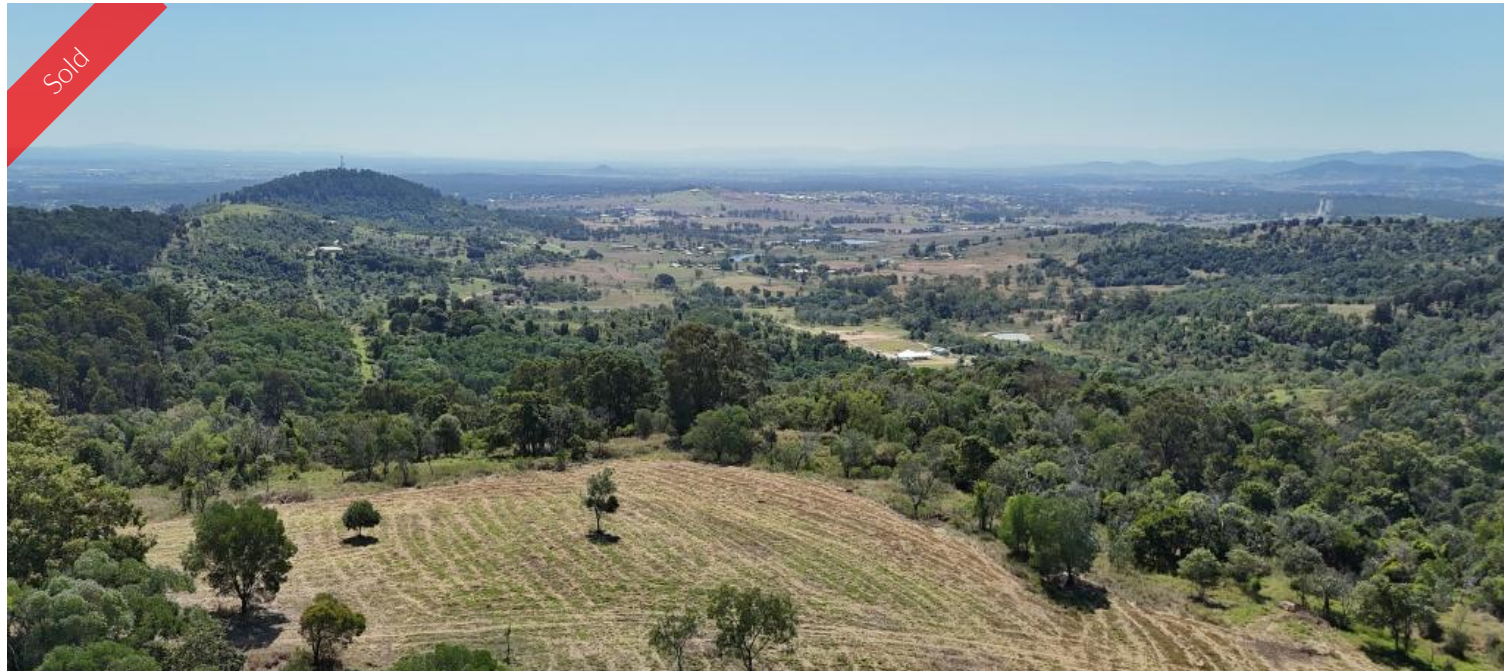
Lot 1 & 2 Norfolk Rd, Plainland