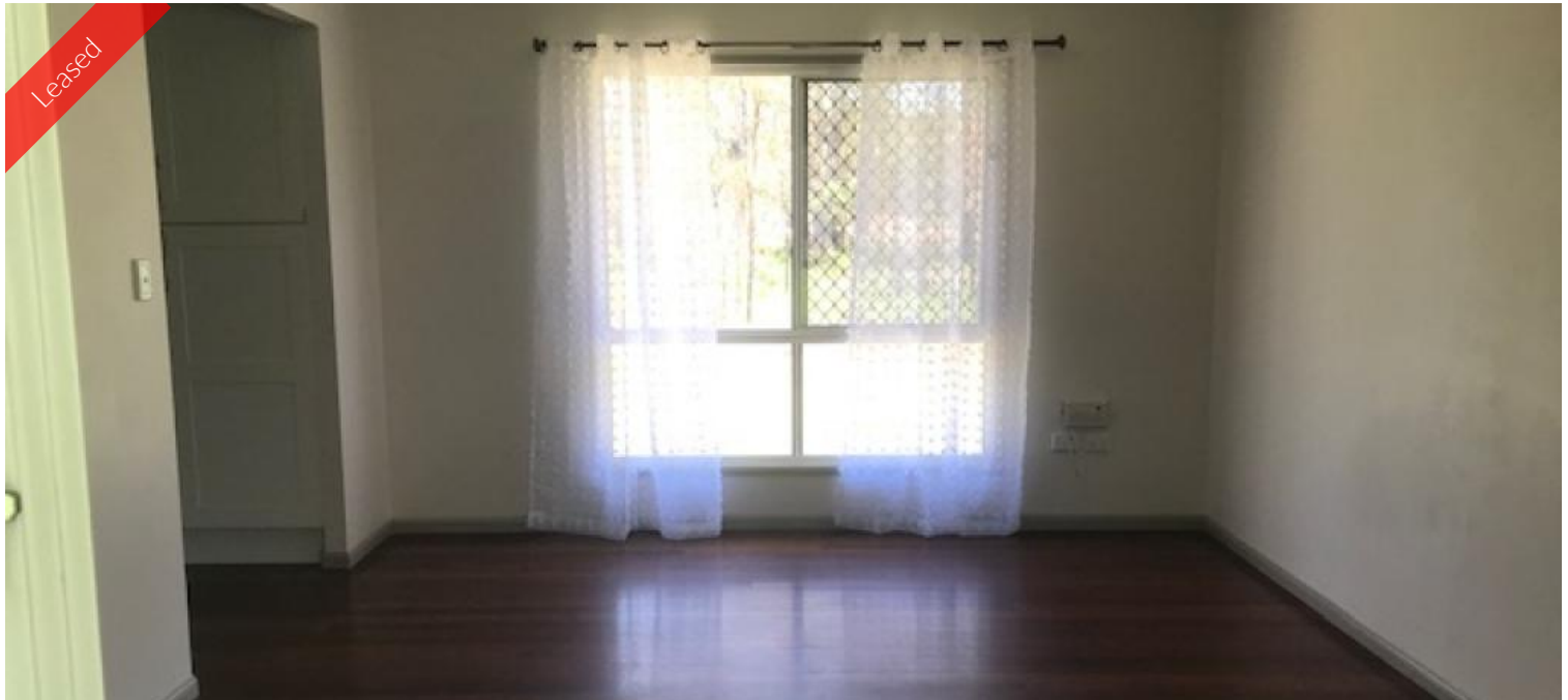
4 Qually Rd, Lockyer Waters