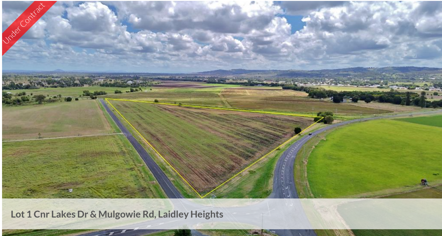
Lot 1 Cnr Lakes Dr & Mulgowie Rd, Laidley Heights