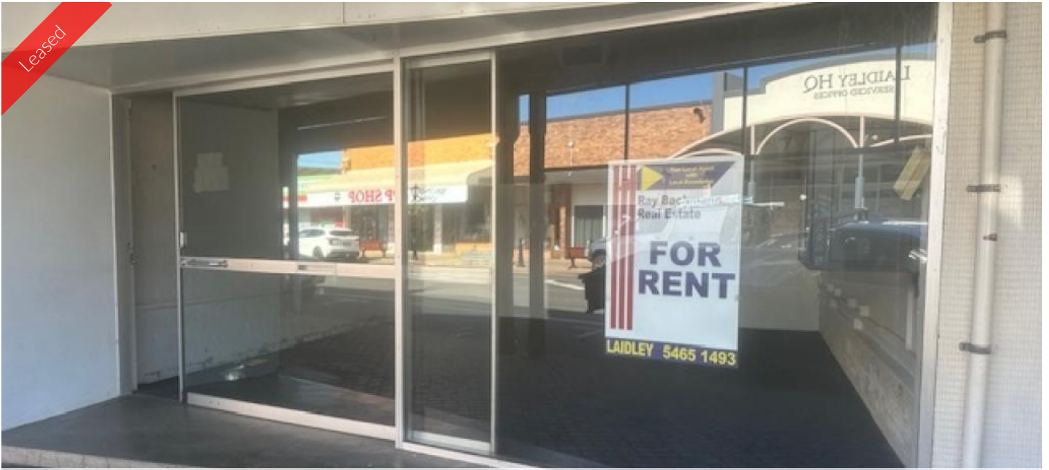
144 Patrick St, Laidley